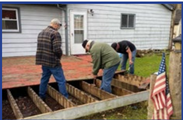
The Post purchased materials and the members replaced an old deck for a local veteran in need

In late June, volunteers from Post 3946 and West Michigan Flag Pole set a flag pole for Bishop Hills Elder Care Community. In early August, Post 3946 members performed the VFW Flag Dedication Ceremony at the non-profit senior living community and raised a new American flag on the pole.